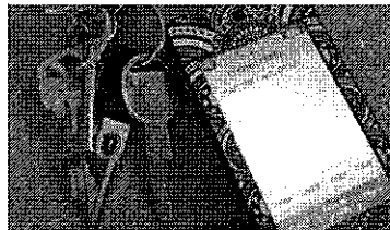
Texting while driving contributes to 8-13% of road crashes.

Roughly one in four auto accidents involve the usage of a cellular phone. Despite this figure, drivers continue to hold long, drawn-out conversations whilst driving. Two obvious questions arise from these facts: why do drivers continue using their phones while driving and what can be done to remedy this situation?